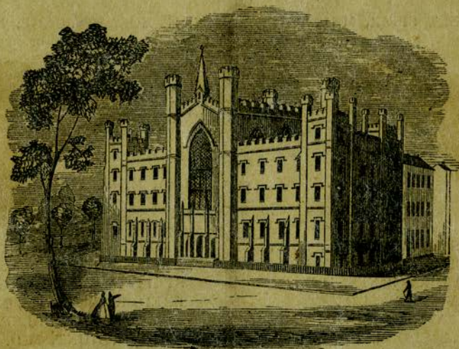
UNIVERSITY OF THE CITY OF NEW YORK.